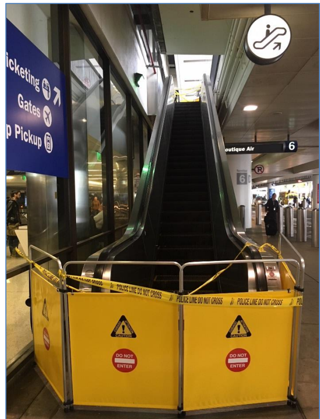
Terminal 6, Arrivals Level Curbside