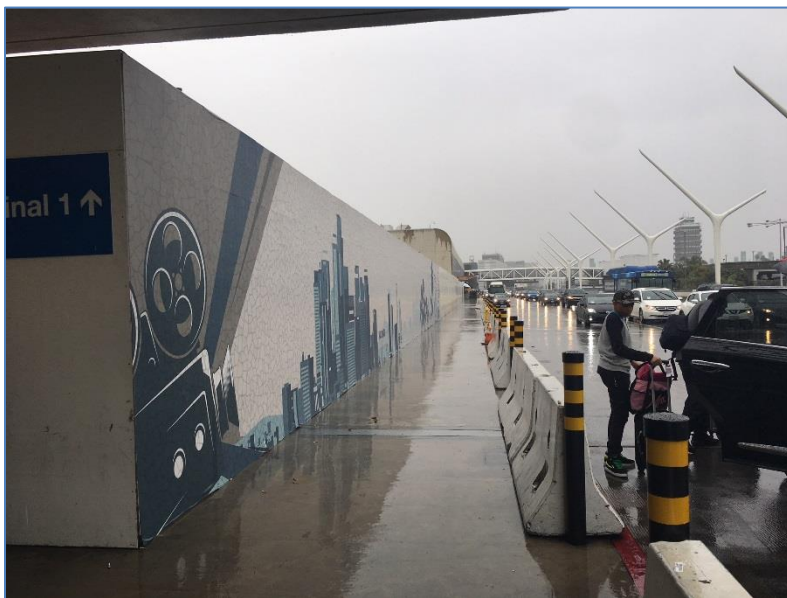
Departures Level, Curbside Between Terminals 1 & 2