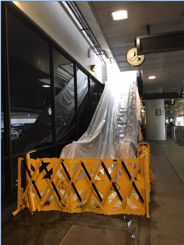
Terminal 3, Arrivals Level Curbside