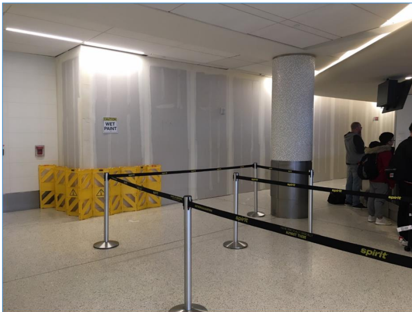
Terminal 5, Ticketing