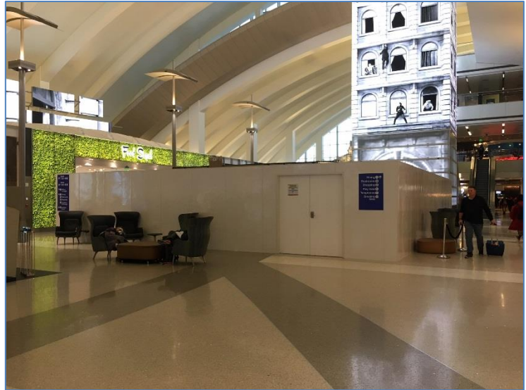
Terminal B, Departures Great Hall Area