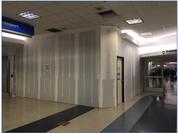
Terminal 4, Arrivals Level