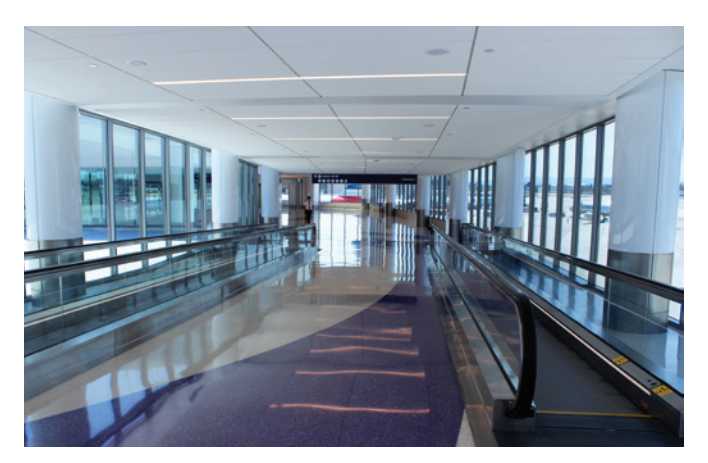
The walkway between Terminal 4 and the Tom Bradley International Terminal opened in February 2016.

The window-lined T-4 connector provides a sleek, convenient and secure passenger connection between the Tom Bradley International Terminal and the southside terminals.