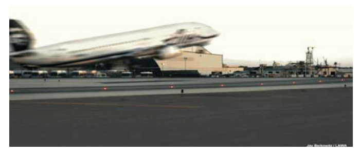
Red lights indicate stop while air traffic passes by much like regular street traffic lights.

Pilots approaching a runway equipped with Runway Status Lights will see red lights illuminated if LAX's ground surveillance radar detects traffic on or approaching that runway. Clearance to cross or enter a runway must be given by air traffic control. Pilots must verify clearance before proceeding even after the warning lights are no longer illuminated. The lights are installed on eight taxiways intersecting more than one runway. LAX is the first airport to have the lights installed on multiple runways. Runways Status Lights are the latest safety enhancement at LAX.