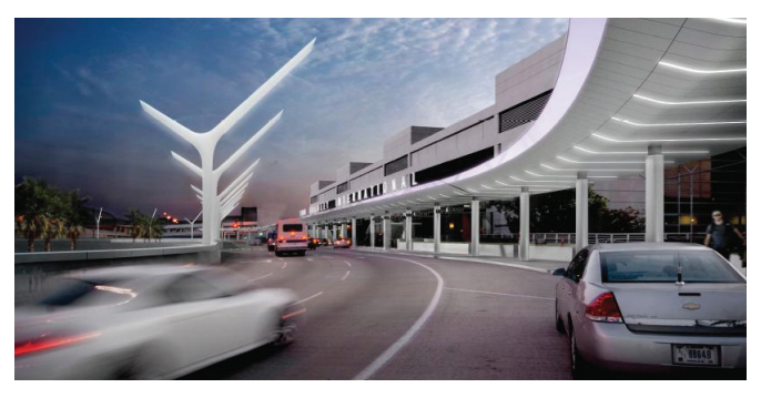
The Curbside Appeal Project dramatically updates the entrance to the existing Tom Bradley International Terminal with new canopies, lighting and landscaping that ties into the new architectural look of the terminal.

To mitigate the impact on travelers, the construction will be completed in phases, with just two lanes being closed at any one time. Construction will largely take place during evening hours (from 12 to 8 am), effectively allowing for as little passenger and motorist inconvenience as possible. All terminals will remain open for normal operations during construction.