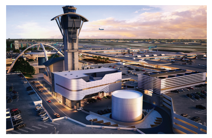
Preliminary architectural rendering of the new Central Utility Plant, with the FAA air traffic control tower and Theme Building in the background.