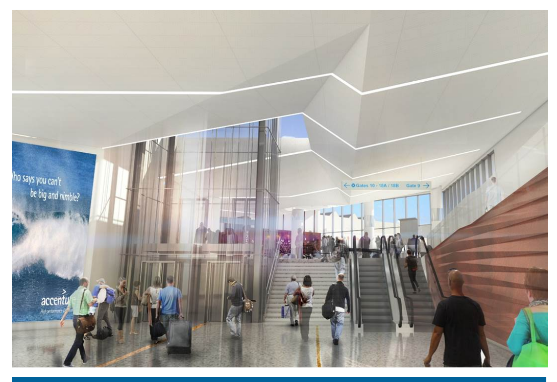
A conceptual rendering of Terminal 1's post-security screening recompose area depicts the use of natural light and modern finishes, both of which will be a highlight of the terminal modernization effort.

Technological progress has provided efficient means to ease some of the stress associated with air travel.