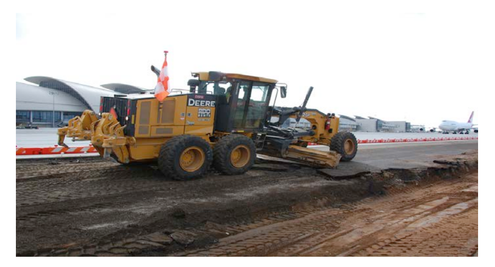
Tier 4i Grader Operating on Taxiway T