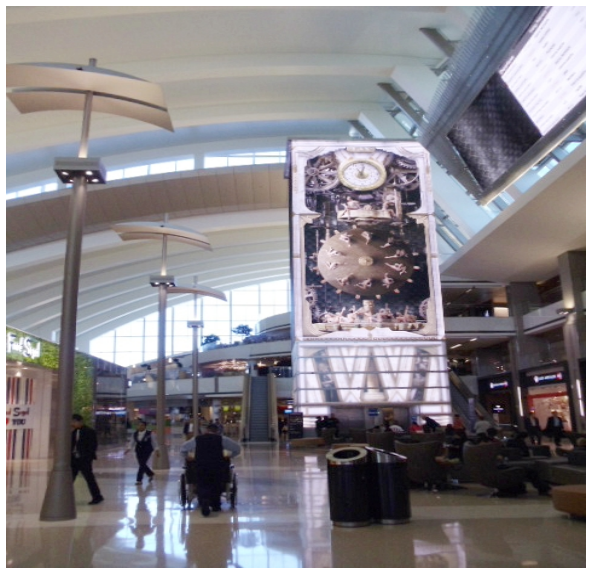
Villaraigosa Pavilion at the new Tom Bradley International Terminal

The Villaraigosa Pavilion at the New Tom Bradley International Terminal (TBIT) opened September 2013 as part of the Bradley West project. The new terminal was designed to achieve LEED Silver Standards through optimized energy performance, enhanced water conservation, effective construction waste management practices, the use high recycle content materials, and other innovative design features. LAWA submitted documentation to the USGBC in 2014 to obtain LEED certification for the new Bradley West terminal. The TBIT Renovations project, which renovates portions of the original Bradley terminal, was designed and is being constructed to LEED Silver standards. The TBIT Renovations project incorporates energy efficiency, water reduction technologies, and effective construction waste management practices. The project also places an emphasis on using high recycle content materials and regionally sourced materials for construction. For both the new terminal and renovation projects, LAWA has purchased green power credits to support the development of renewable energy technologies.