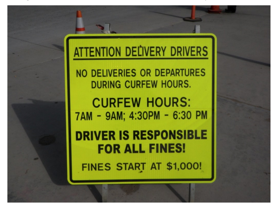
Figure 6-1: Posted Notices Remind Drivers of Delivery Curfew Hours

It was the observation of the Third Party Monitor, and confirmed by LAWA's environmental monitor, that excessive idling was less of an issue as compared to previously implemented LAX Master Plan projects such as the South Airfield Improvement Project (SAIP). The CARB anti-idling rule has been in place long enough that most vehicle and equipment operators are aware of its existence. Also, due to the price of diesel fuel, it is cost-effective to turn the vehicle engine off when not needed.