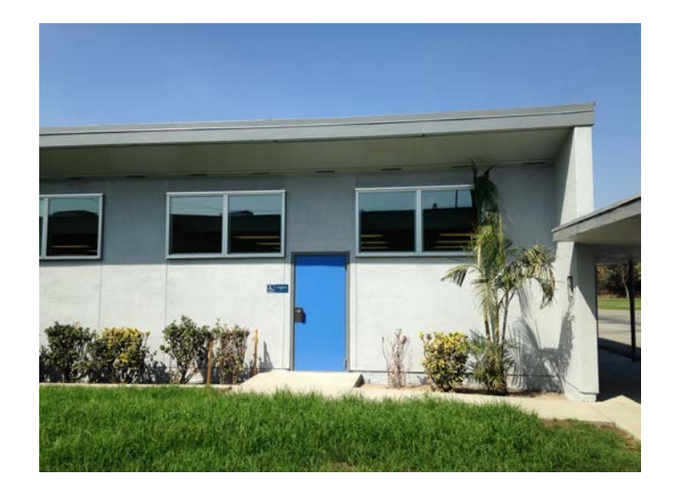
Felton Elementary School, September 2014 New double-paned windows and solid doors

In October 2014, construction of Felton Elementary School was completed.