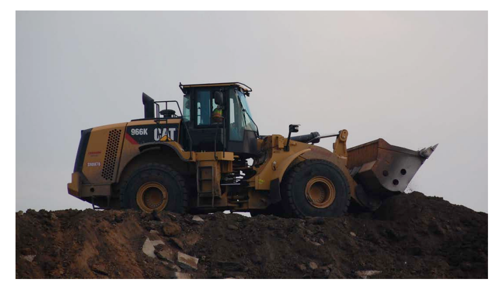
Model Year 2014 Rubber Tire Loader Operating at WAMA Site

• The Qantas Hangar project is being implemented coincident with the WAMA project; as such, the construction equipment utilized on WAMA is applicable to the Qantas Hangar.