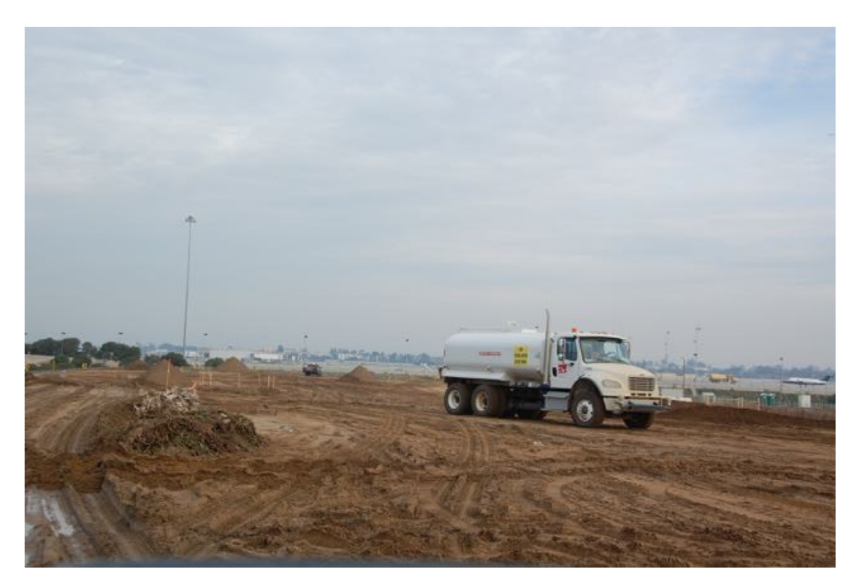
Figure 7-1: Dust Control Being Conducted on WAMA