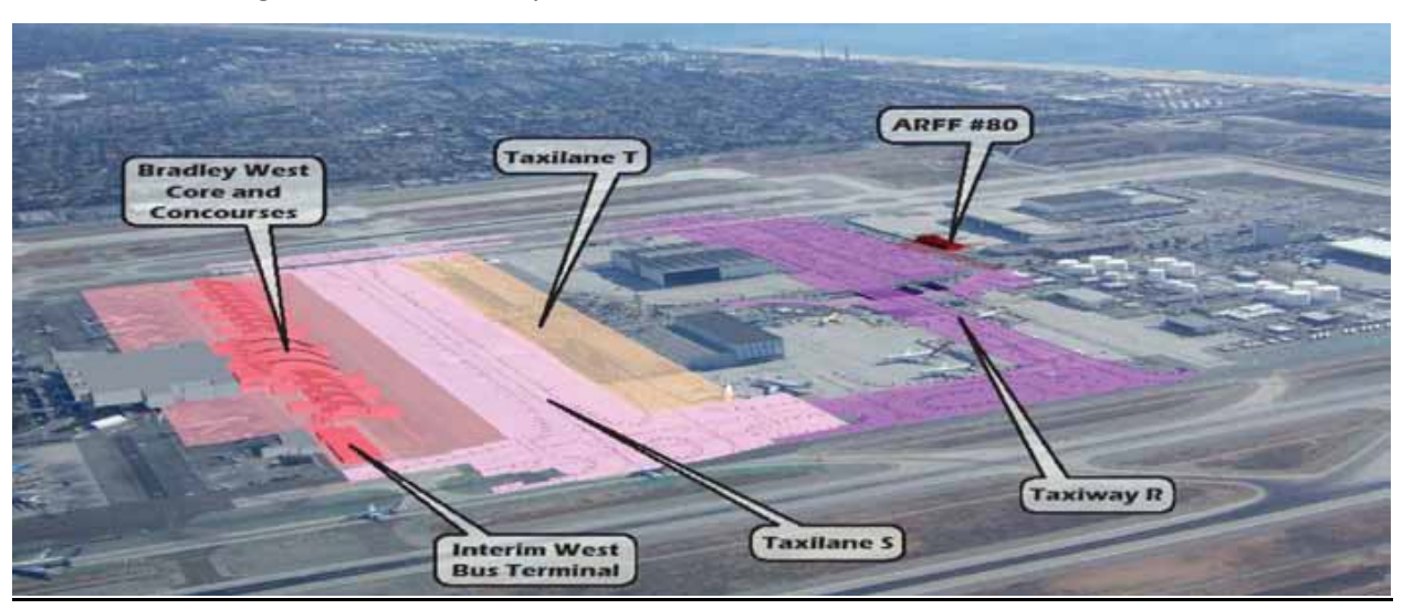
Figure 1.2.1-1: Taxiway T Phase 1 Construction Location on the Airfield

1.2.1 Taxiway T Phase 1 Project – Construction of Taxiway T Phase 1 commenced in August 2013 and construction was substantially completed as of August 31, 2014. This two-part project represents the first phase of the future Dual Taxilane / Taxiway System between the proposed Midfield Satellite Concourse and the Tom Bradley International Terminal. It consists of a new 3,785-foot long Taxiway T Phase 1 parallel to the previously completed Taxilane S Master Plan Project. This construction also included relocating fuel lines and other utilities, all grading, airfield signage and lighting, and construction of power and communication duct banks. The location of Taxiway T Phase 1 is shown in the following figure 1.2.1-1.