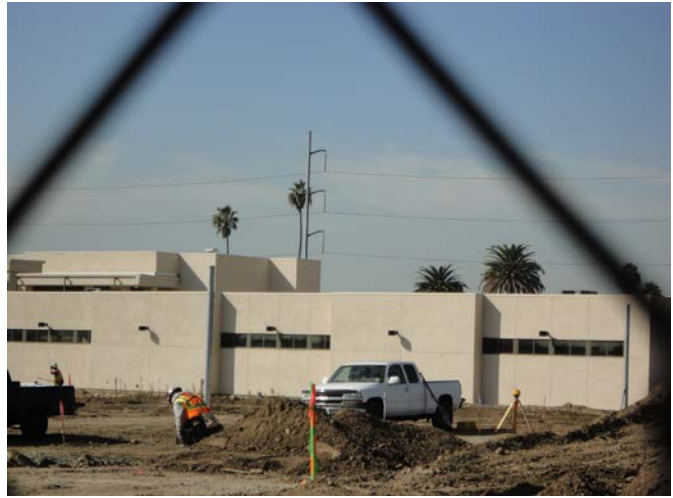
Jefferson Elementary School, October 2014 Construction of new section of the school

In April 2014, the sound attenuation portion of Jefferson ORG was completed (ORG stands for Overcrowding Relief Grant). New construction is continuing at this location on the site north of Jefferson Elementary and is expected to be completed in 2015.