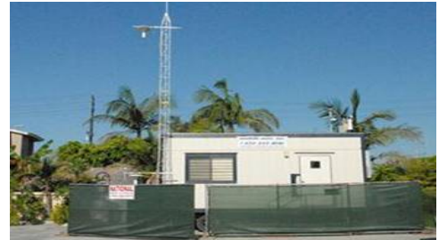
LAX AQSAS Community East monitoring station measuring air pollutants