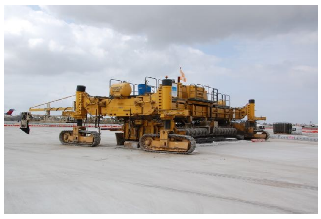
Figure 1.2.1-5: Specialty Paving Equipment Used During Taxiway T Phase 1 Construction