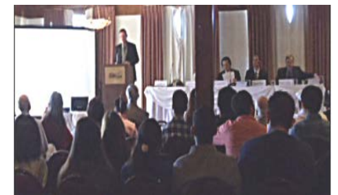
LAX AQSAS Public Symposium

A Public Symposium was held on Saturday, September 28, 2013 at The Proud Bird Restaurant in Los Angeles to discuss the LAX Air Quality and Source Apportionment Study (AQSAS). Key technical team members presented the study's findings, followed by an hour-long, facilitated question and answer period. Informational materials regarding the study were also provided. The study and informational materials can be found on the web page titled, Final Report and Materials, at http://www.lawa.org/AirQualityStudy.aspx?id=7716.