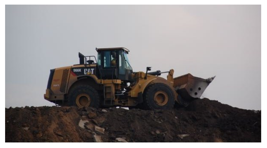
Figure 1.2.3-3: WAMA Construction Progress – Tier 4<sub>Final</sub> Equipment in Use

During the reporting period, a total of 156 pieces of equipment underwent Independent Third Party Monitor evaluation. These are shown in Table 1.2.3-1, below: