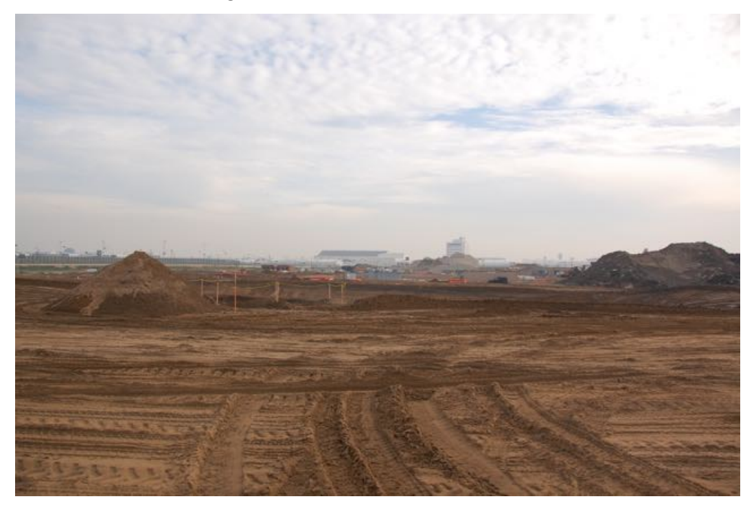
Figure 1.2.3-2: WAMA Construction Site