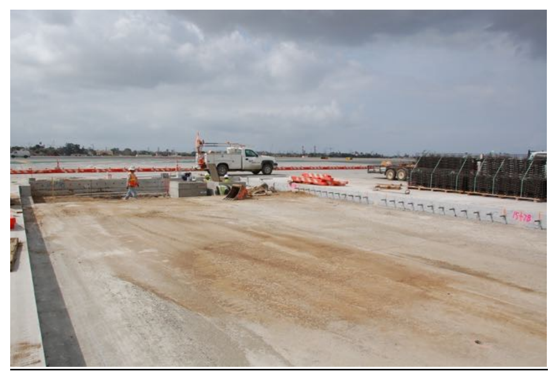
Figure 1.2.1-3: Taxiway T Phase 1 Construction in Progress – June 2014