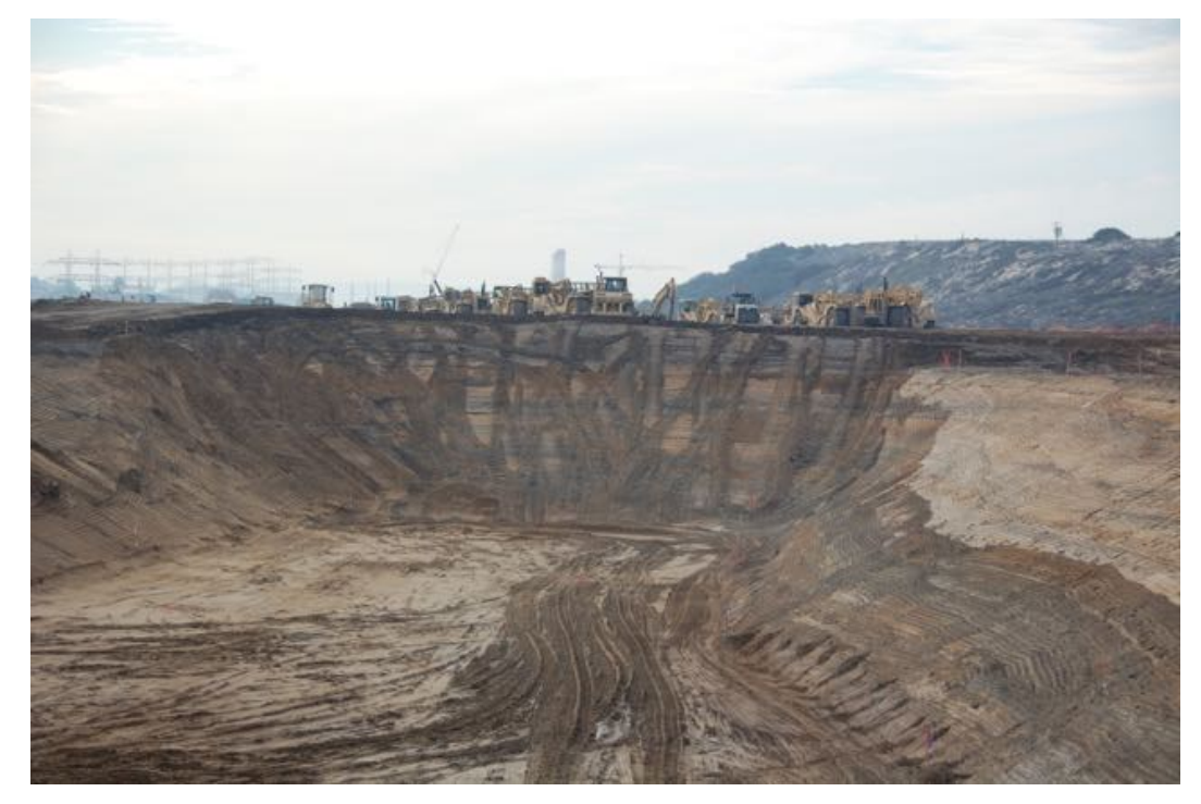
Figure 1.2.4-1: Qantas Hangar Construction Site

1.2.4 Qantas Hangar - The Qantas Hangar project is being implemented coincident with the WAMA project; as such, the construction equipment utilized on WAMA is applicable to the Qantas Hangar. The photo, below, shows the foundation excavation work being performed at the Qantas Hangar site: