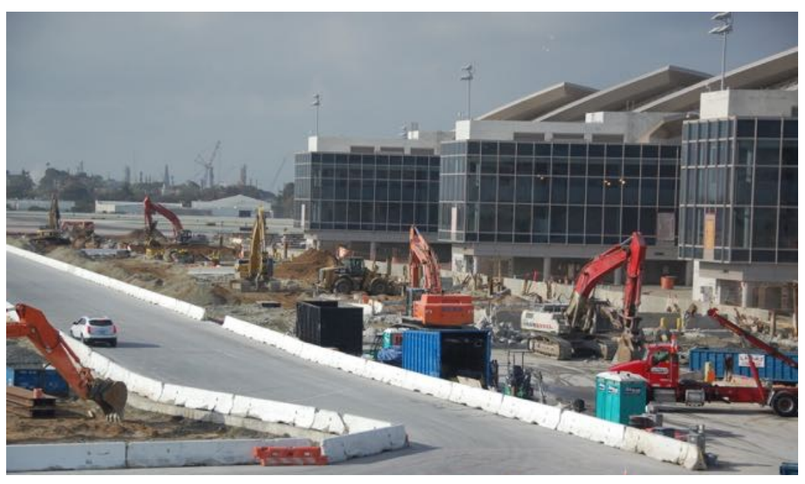
Figure 1.2.2-1: TBIT – East Apron Construction Progress