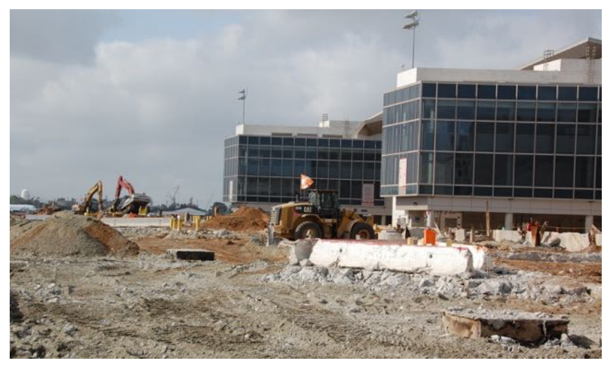
Figure 1.2.2-2: TBIT – East Apron Construction Progress – Tier 4i Equipment in Use