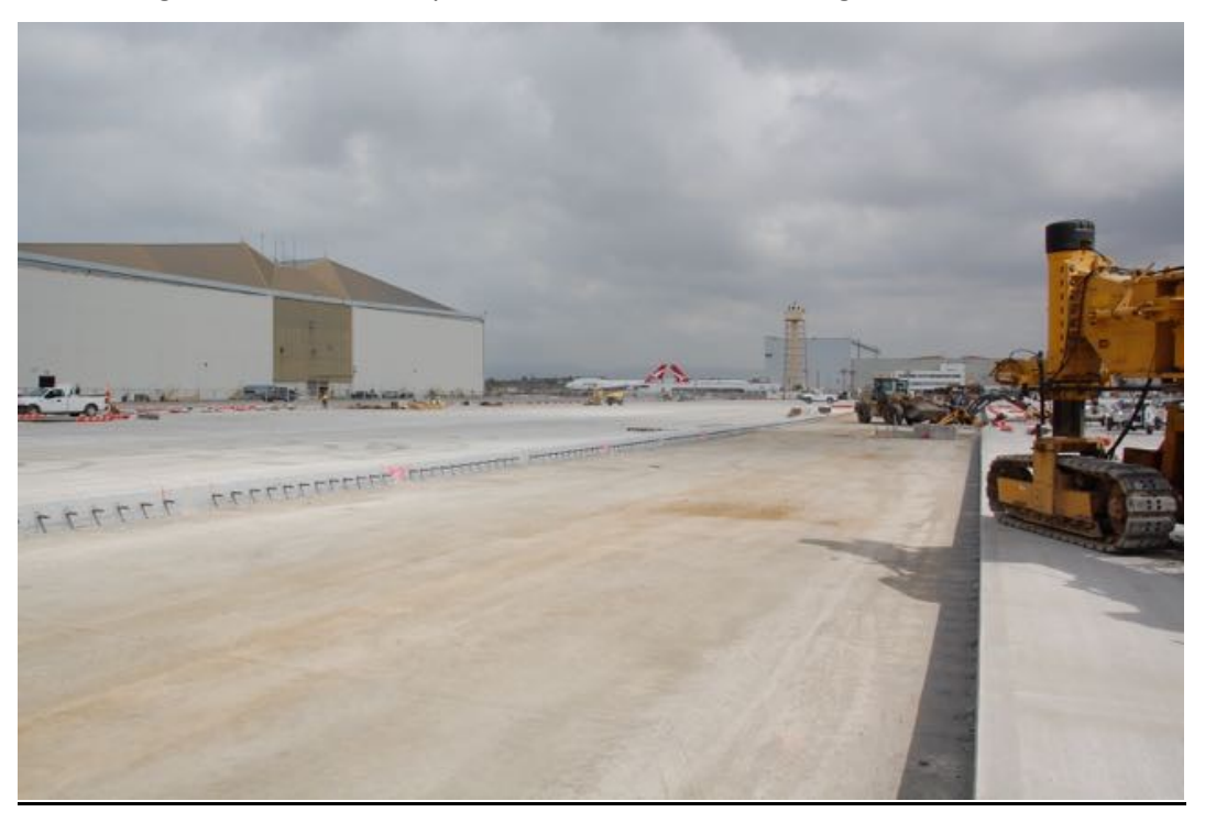
Figure 1.2.1-4: Taxiway T Phase 1 Construction in Progress – June 2014