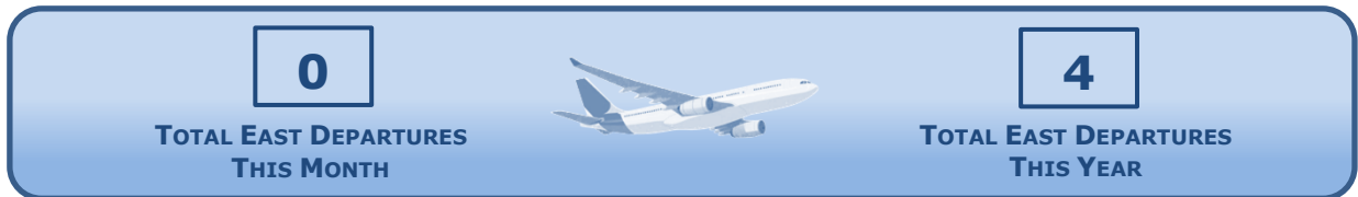
East Departures Yearly Comparison

The number of East Departures may vary from month to month due to weather, air traffic volume, and/or operational factors.