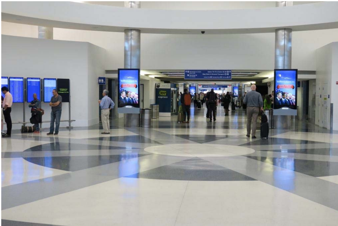
Work on a $573 million renovation of Terminals 7/8 continues taking shape in October.