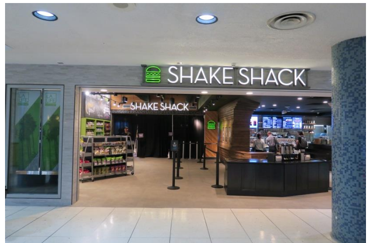
A food court including Shake Shack, LA Life and a relocated Starbucks has opened near the escalators in Terminal 3.