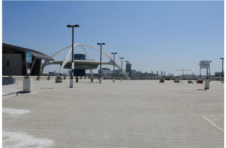
The top level of Parking Structure 6 will be closed until early September for expansion joint repairs and waterproofing work.