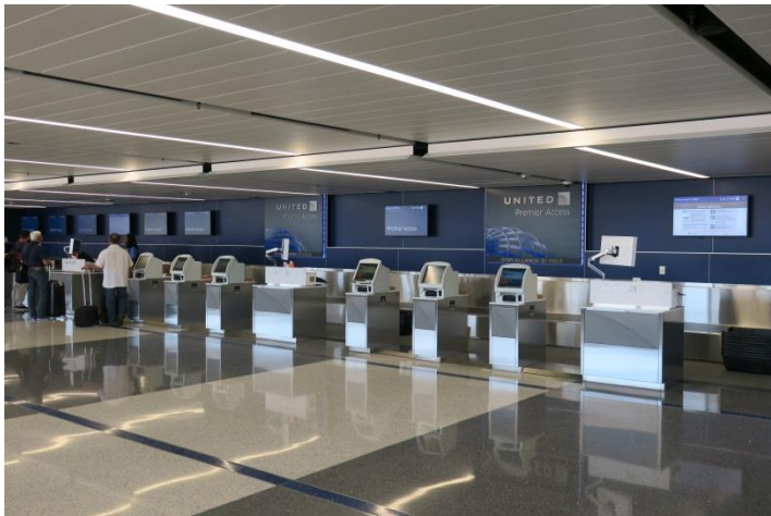
The new United Airlines Premiere ticket lobby opened in the west end of Terminal 7 in June.