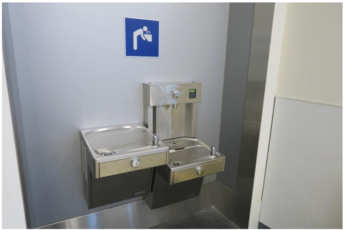
A new water bottle filler is available across from Gate 75A.