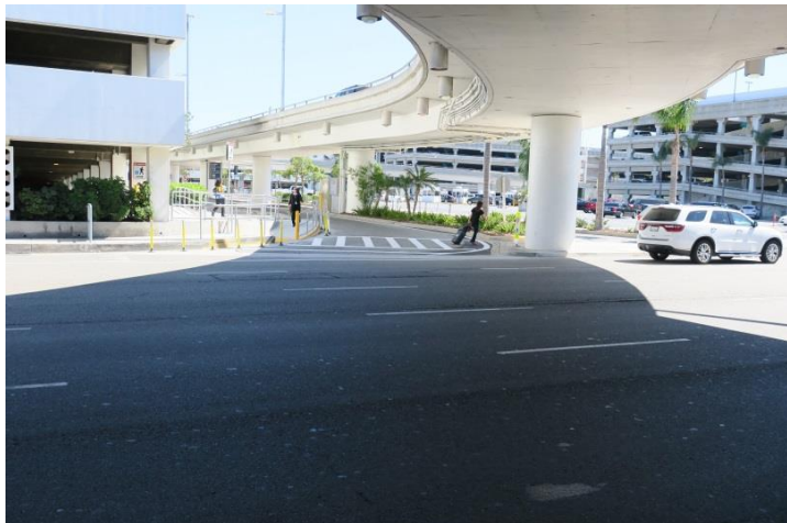
The southbound lane of West Way has reopened after the turning radius was widened to allow for bus access.