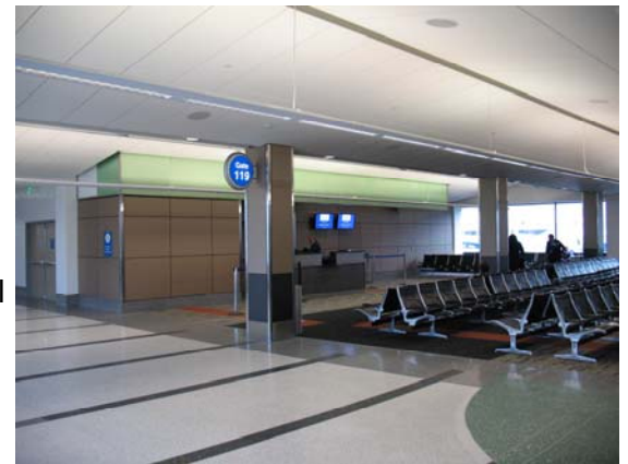
Modernized boarding gates provide better lighting, new flooring and digital displays.