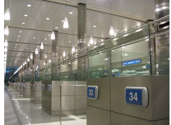
Upgraded Customs Arrivals Hall helps process travelers more efficiently