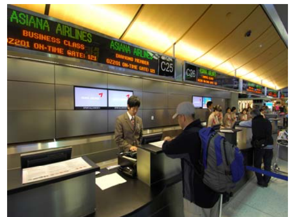
Contemporary style and functionality characterizes new ticketing counters